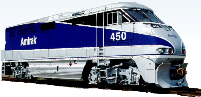
Current paint scheme

Expected delivery date: October 1 through December 2018