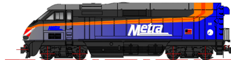
New paint scheme (next 16 units)